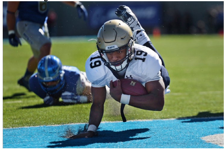
TOUCHDOWN!!! Or PIC 6 you WIN!!

The Interest on Credit Card is 10-30% if you pay on the credit card before the due date the interest is less!! WOW!!